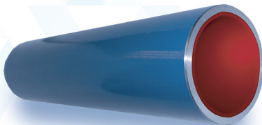
แบบสำหรับน้ำร้อน (ไส้สีแดง-Type H) Class M (Medium)